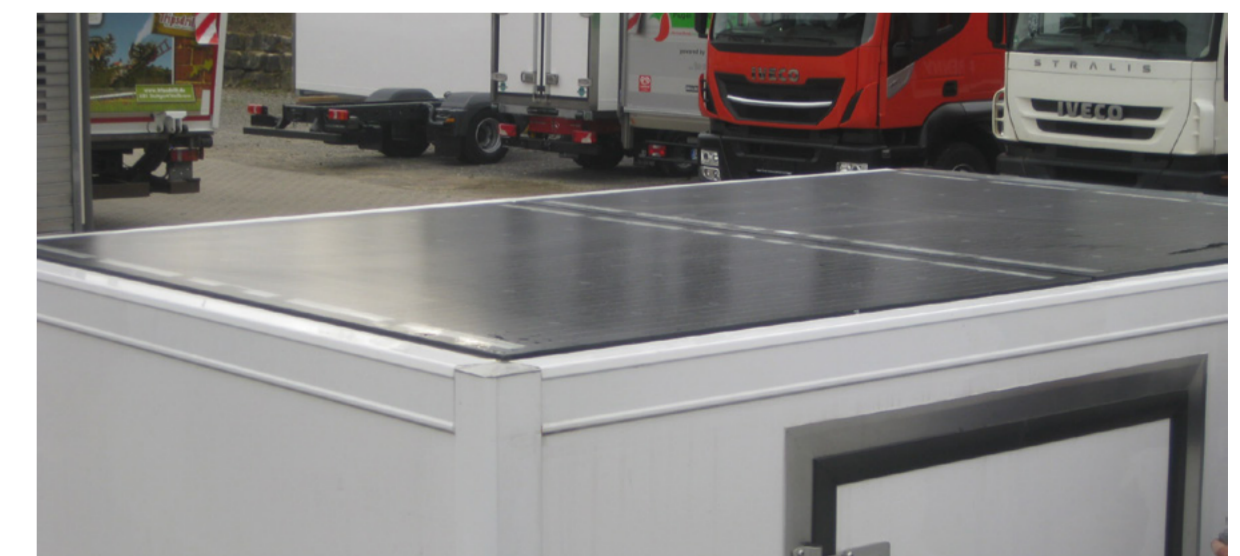
For additional battery charge: solar panels on vehicle's roof