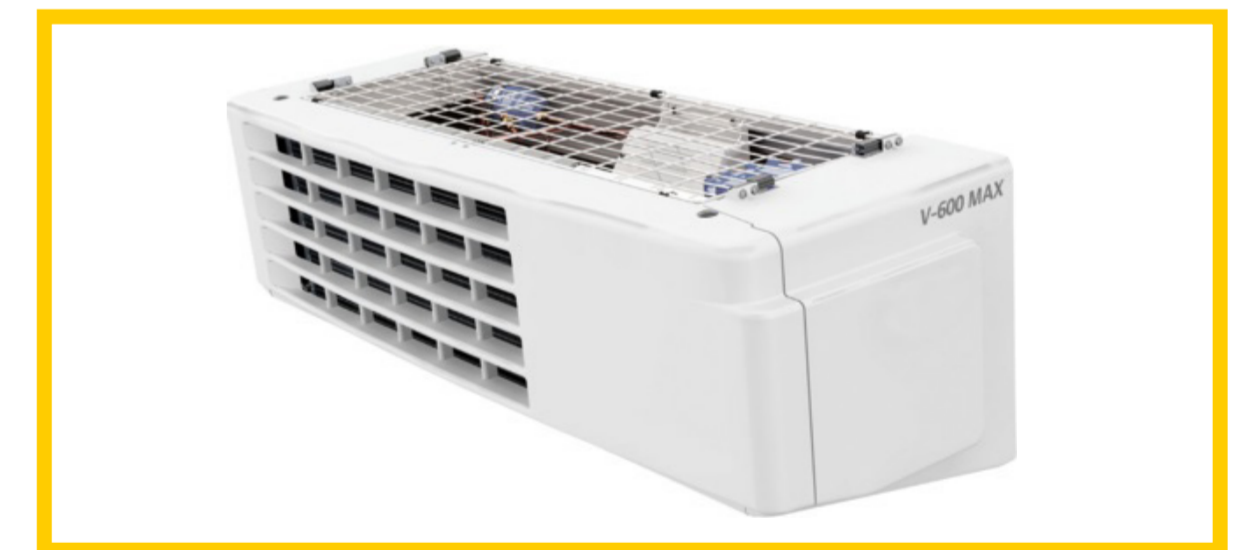
Fully electrical cooling unit