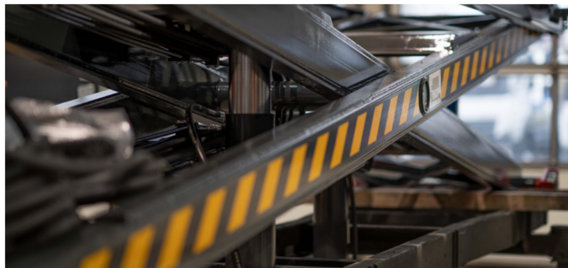
Fully electrically driven scissor lift